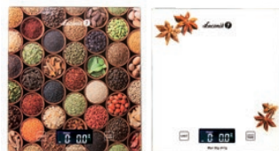
PT 852 EX