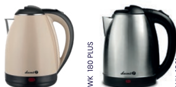
WK 180 PLUS